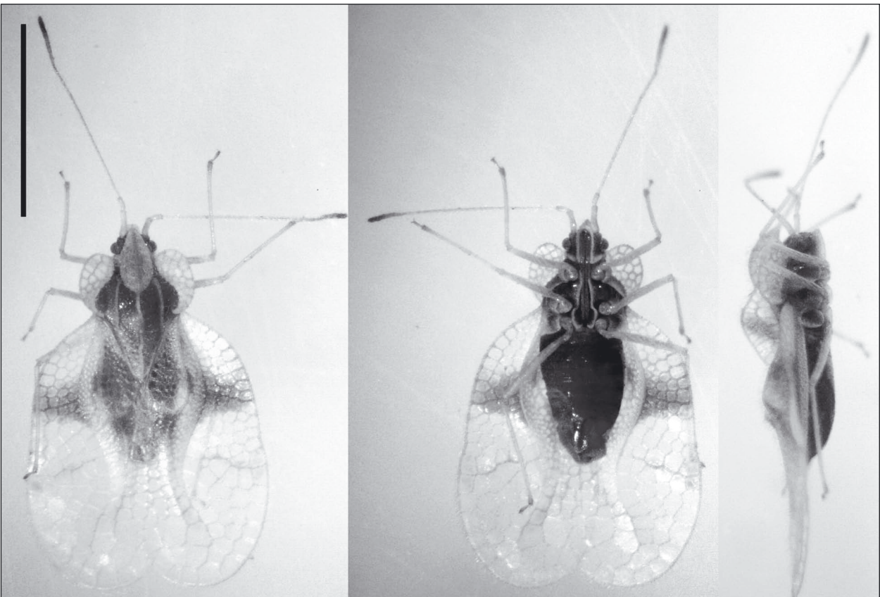
Fig. 2. Adult of Stephanitis rhododendri (bar = 2 mm)