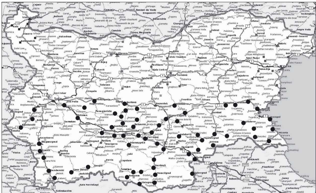
Fig. 3. Distribution of A. spiraeicola in particular locations of South Bulgaria

The rosy leaf-curling aphid, D. devecta , was distributed in all districts, but was found in only 58 locations (from 137 surveyed) at a rather low population density.