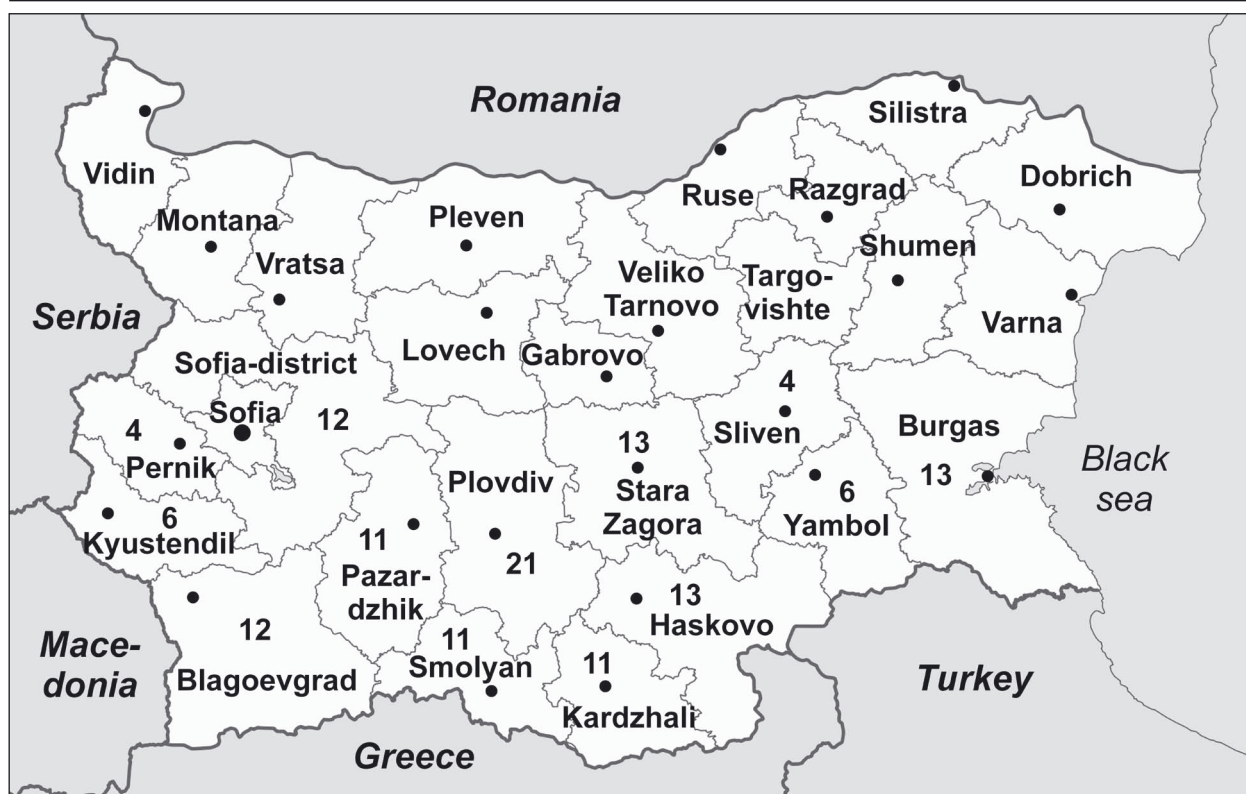
Fig. 1. Administrative map of Bulgaria with the number of the observed micro-regions in the districts of the southern part of the country

Kustendil, Pernik, Sliven and even up to 20 locations in large districts, like Plovdiv, Pazardzhik or Stara Zagora.